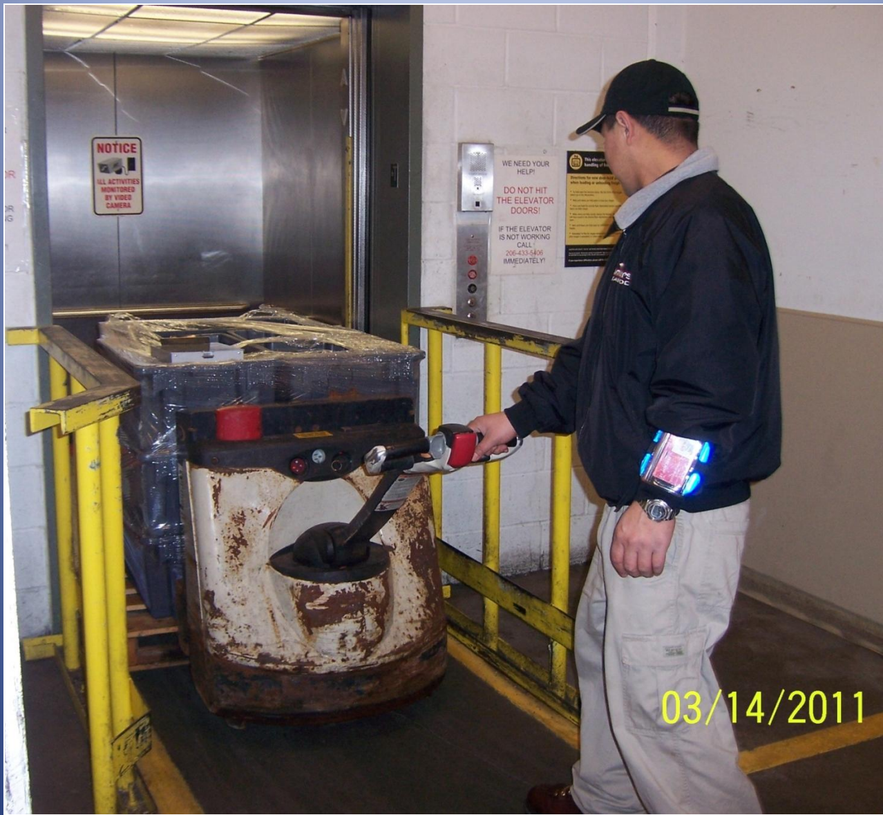
Fresh Fish on Ice: Delivery for HMSHost/Anthony's