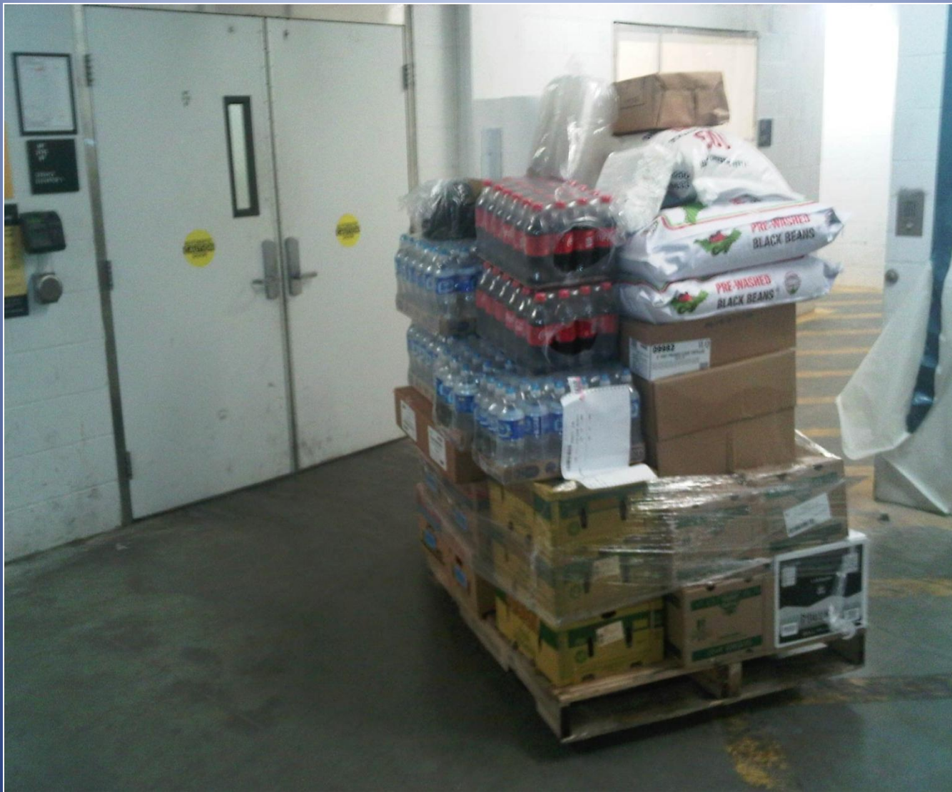
Typical Delivery for Qdoba Mexican Grill