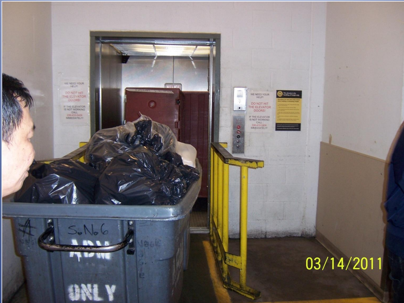
Elevator Congestion: Food Coming In, Garbage Going Out